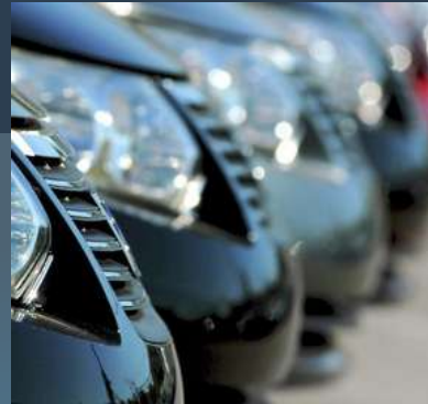
LUXURY TRANSPORTATION SERVICES