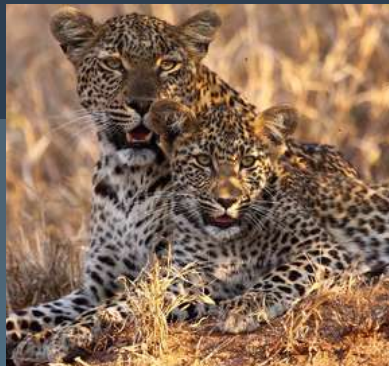
DAY TRIPS LOCAL