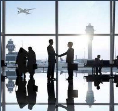
MEET & ASSIST JKIA ONLY