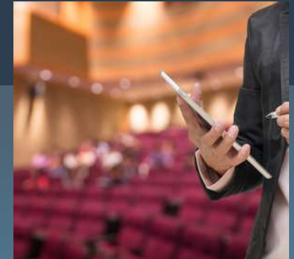
MEETINGS, INCENTIVES, CONFERENCES, EXHIBITIONS.