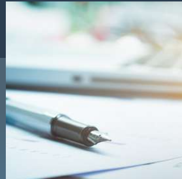
VISA APPLICATION ASSISTANCE